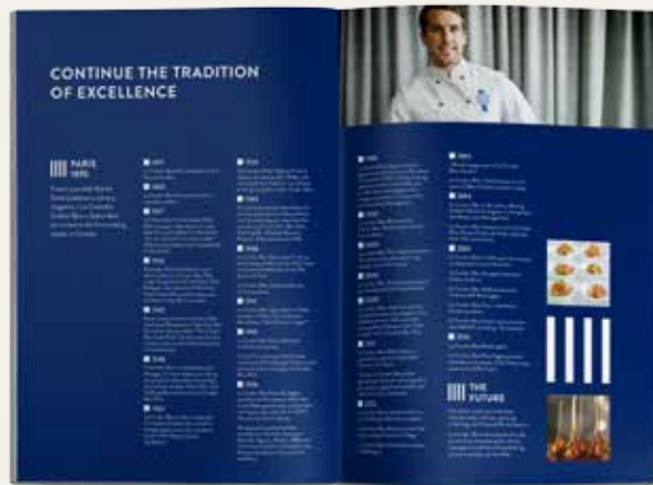
Prospectus cover and spreads