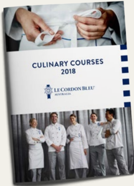
Prospectus cover and spreads