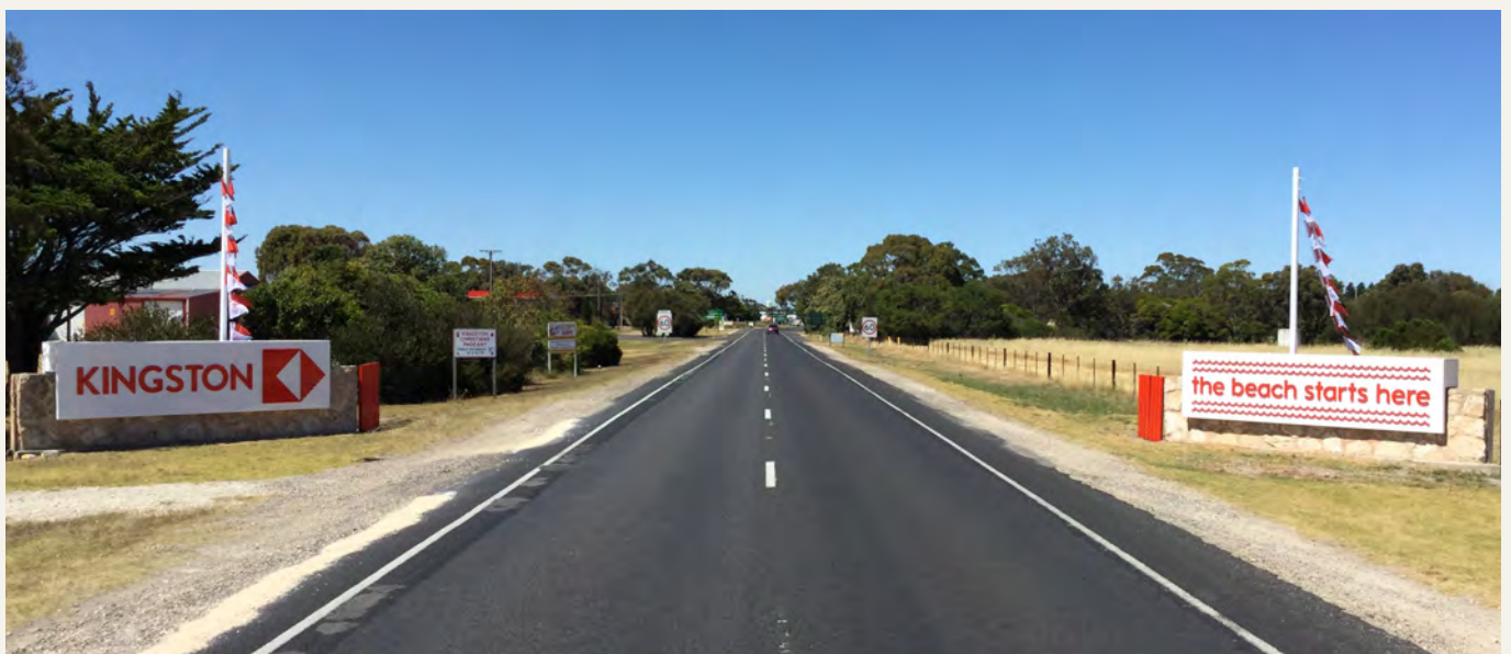
Signage at the gateway to Kingston