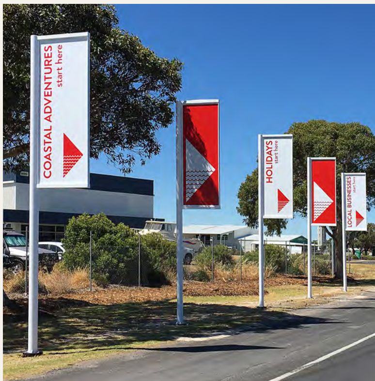
Gateway roadside flags