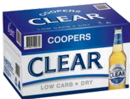
Coopers Clear product and packaging design.