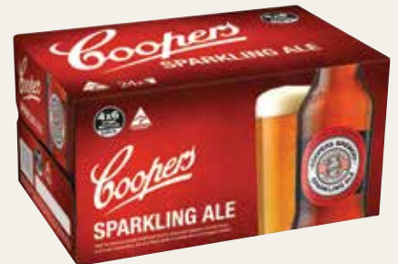
Packaging update with strong colour coding.