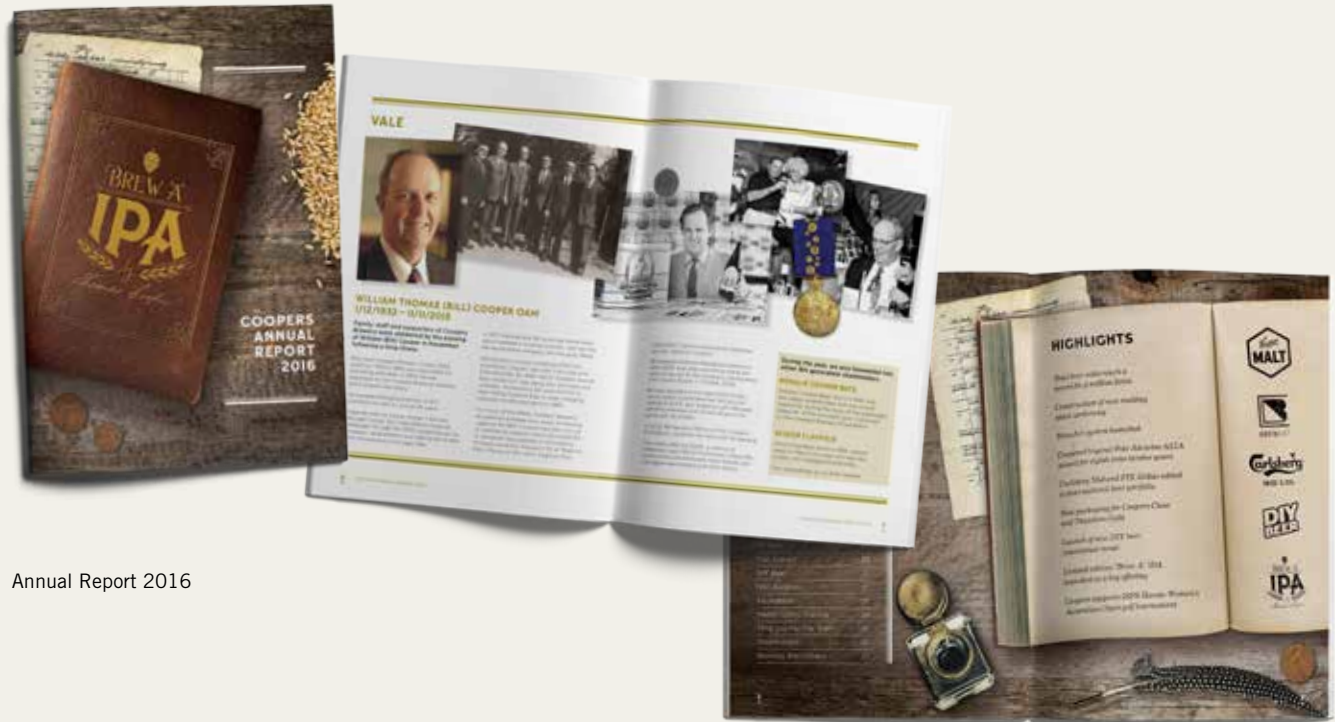
Annual Report 2016

Advertising, design, building meaningful brands.