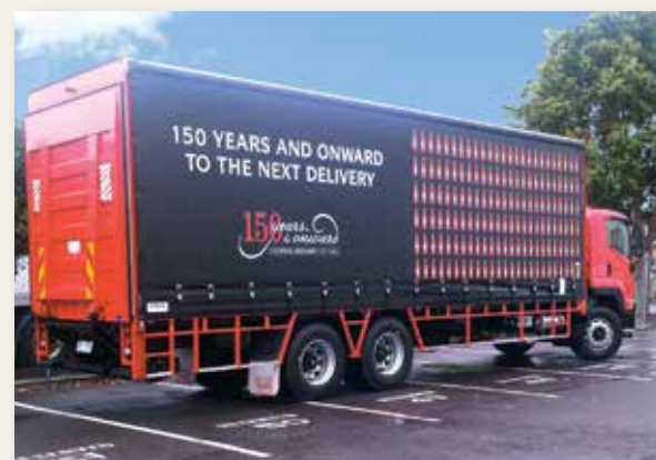
Commemorative 150 years & onward line, emblem and collateral.