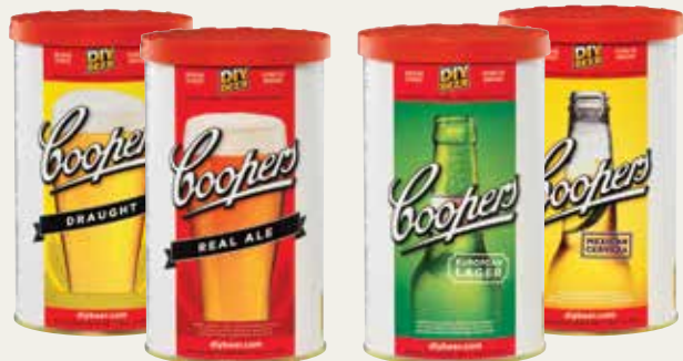
Homebrew packaging design.