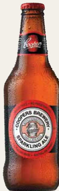
Logo and packaging.