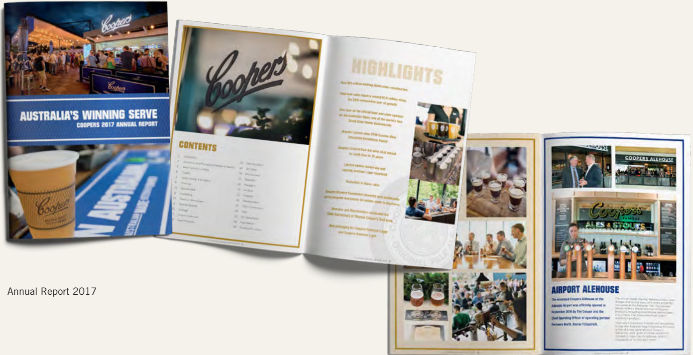
Annual Report 2017

Advertising, design, building meaningful brands.