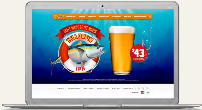
DIY beer recipe of the months graphics

Advertising, design, building meaningful brands.