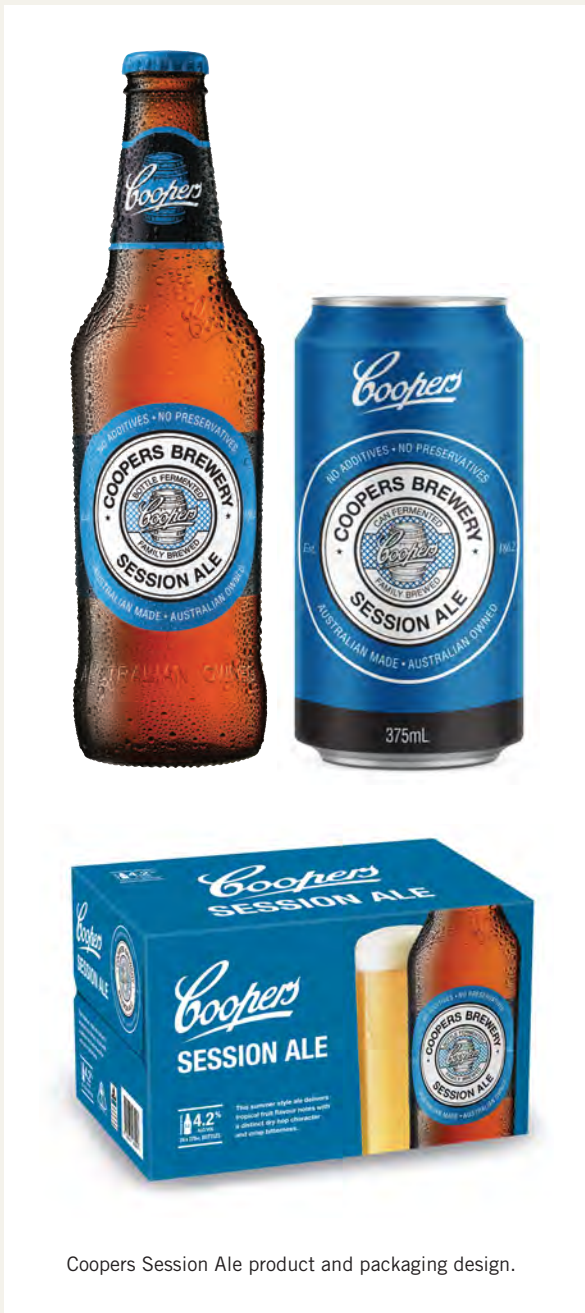
Coopers Session Ale product and packaging design.

Coopers has a 150 year history of brewing excellence, is the largest Australian-owned brewery and still proudly owned and run by the Cooper family. On Creative's long-standing relationship with Coopers has produced some of its most recognisable branding and striking new product, packaging and POS design. Corporate communications are lifted out of the ordinary with signature Coopers style.