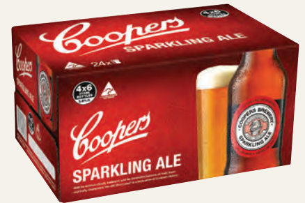
Packaging update with strong colour coding.