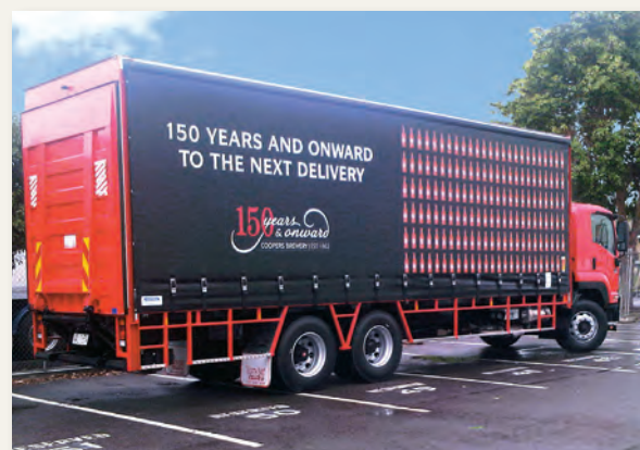
Commemorative 150 years & onward line, emblem and collateral.