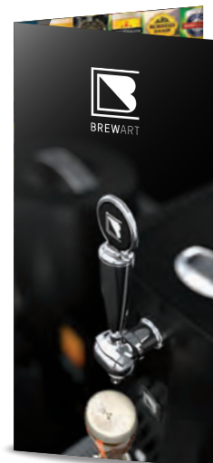
BrewArt brandmark, packaging, web graphics and collateral