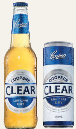
Coopers Clear product and packaging design.