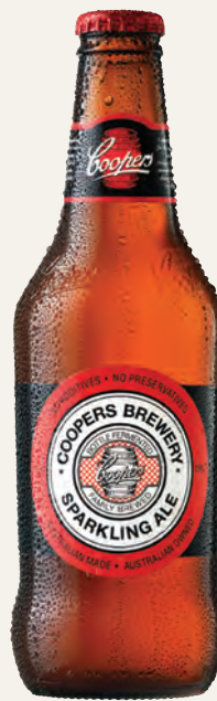
Logo and packaging.