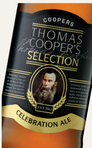
Celebration Ale product and POS design.