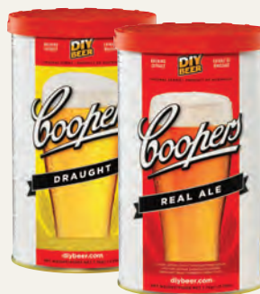
Homebrew packaging design.